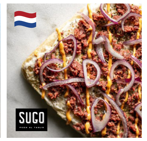
Redefine Pulled Pork Pizza

For more information, contact your REDEFINE MEAT™ sales rep or drop us a line at partners@redefinemeat.com